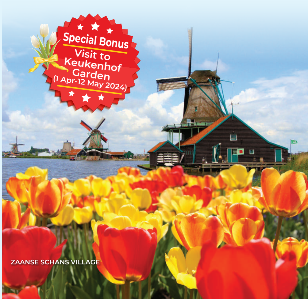
ZAANSE SCHANS VILLAGE