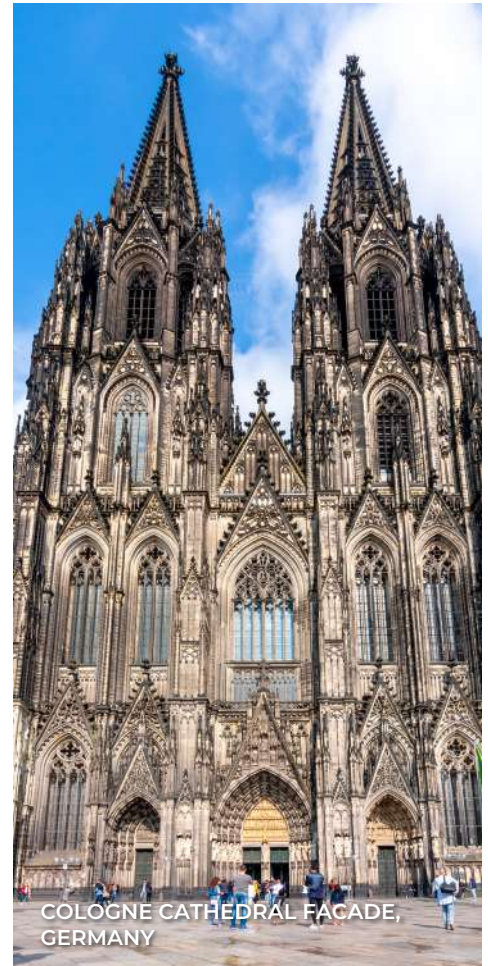
COLOGNE CATHEDRAL FACADE, GERMANY

Today, it's time to indulge in some well-deserved retail therapy at La Vallée Village , a luxurious shopping destination boasting over 100 brand boutiques offering a wide range of items, from fashion and cosmetics to footwear. With incredible discounts of up to 70% on renowned brands like Prada, Furla, LongChamp, Gucci, and Fred Perry, you're bound to find something you love.