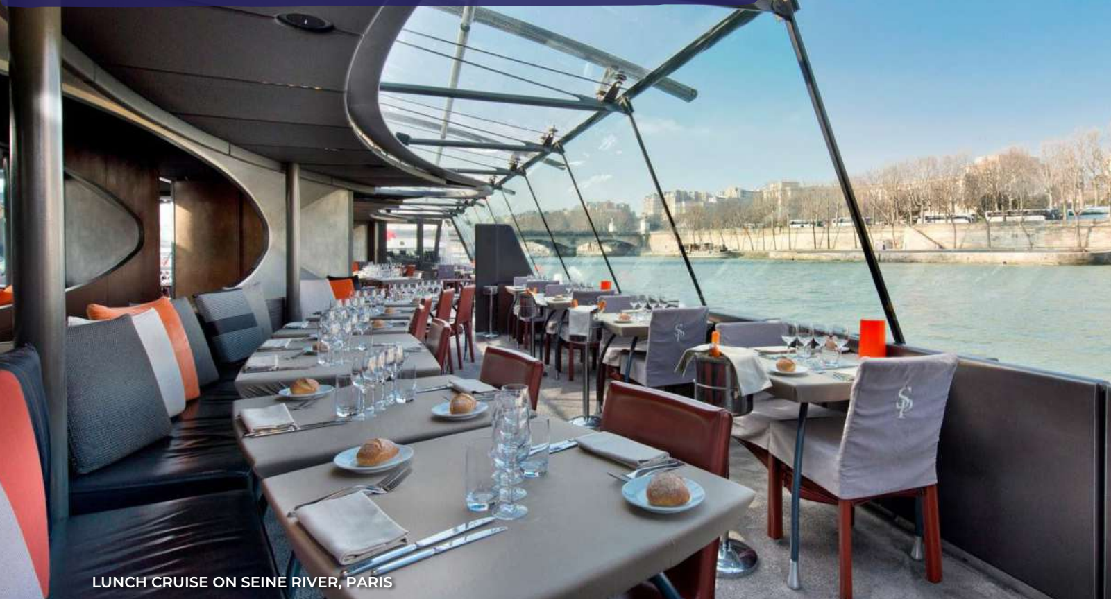
LUNCH CRUISE ON SEINE RIVER, PARIS