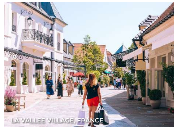
LA VALLÉE VILLAGE, FRANCE